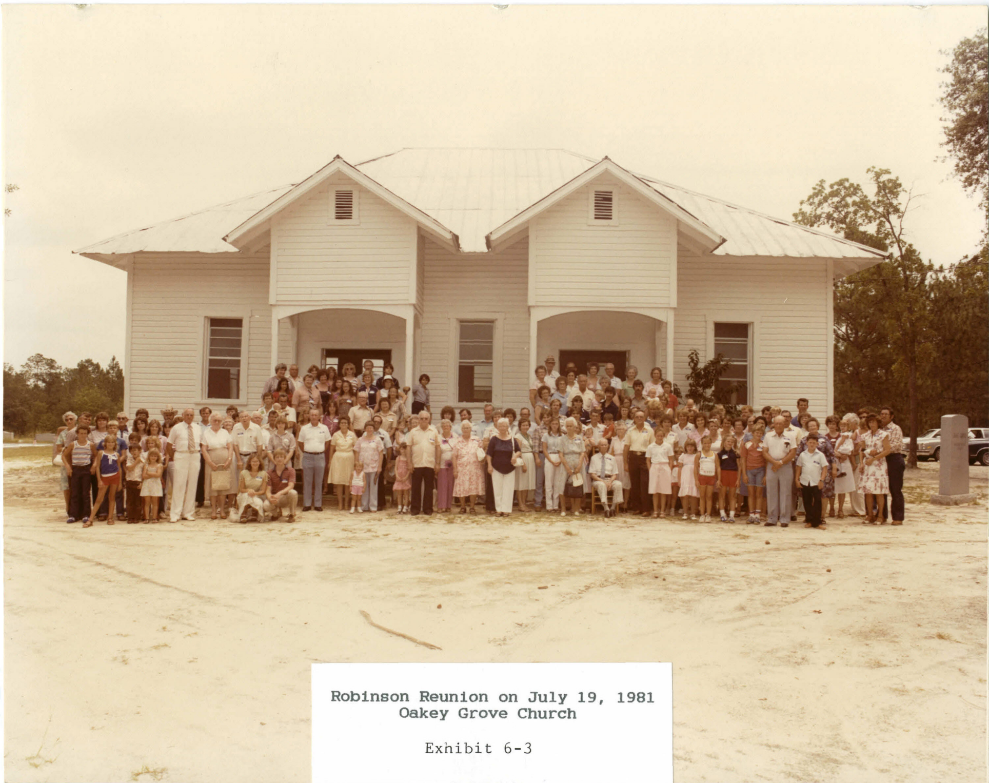
Robinson Reunion on July 19, 1981 Oakey Grove Church