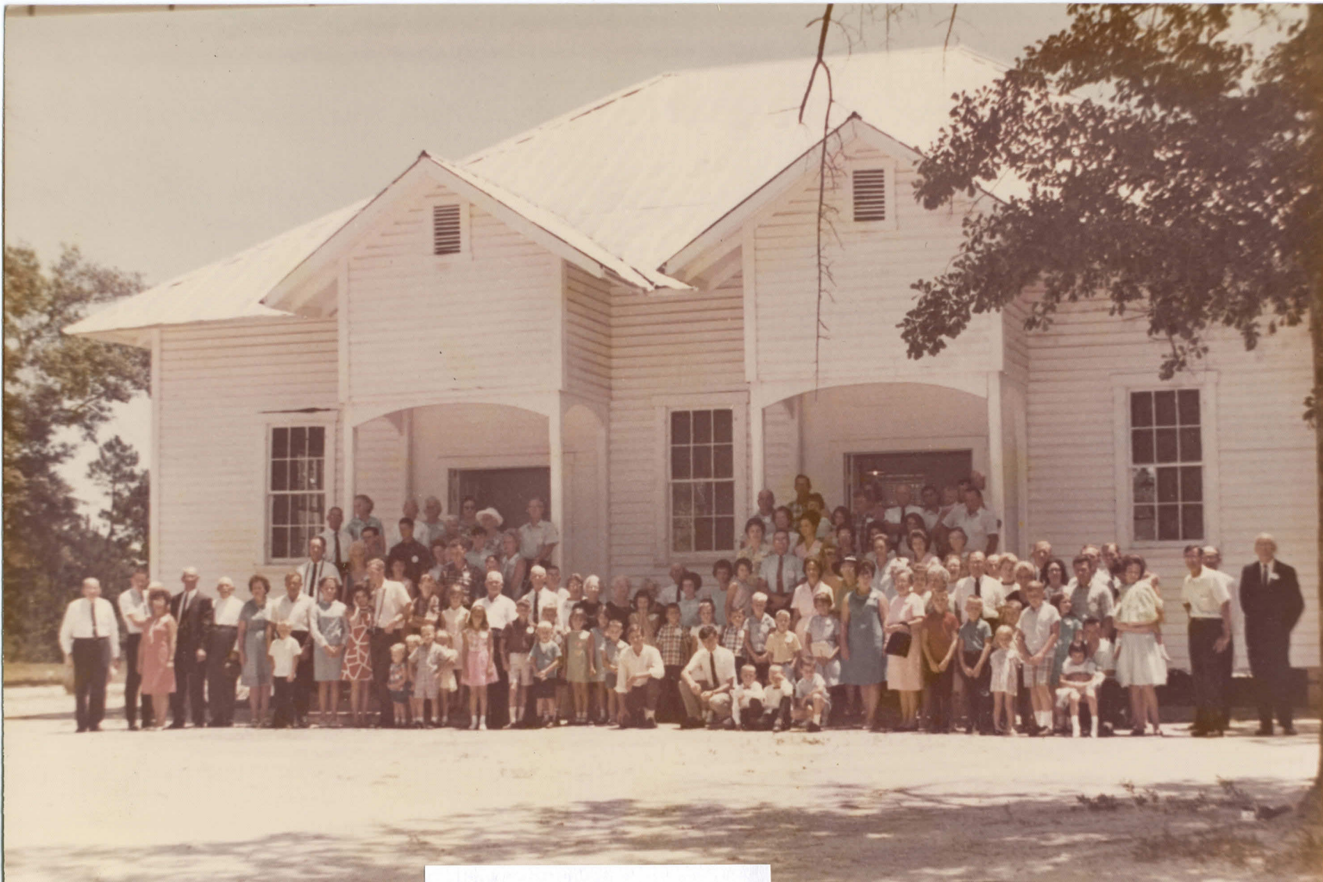
Robinson Reunion in 1966 Oakey Grove Church